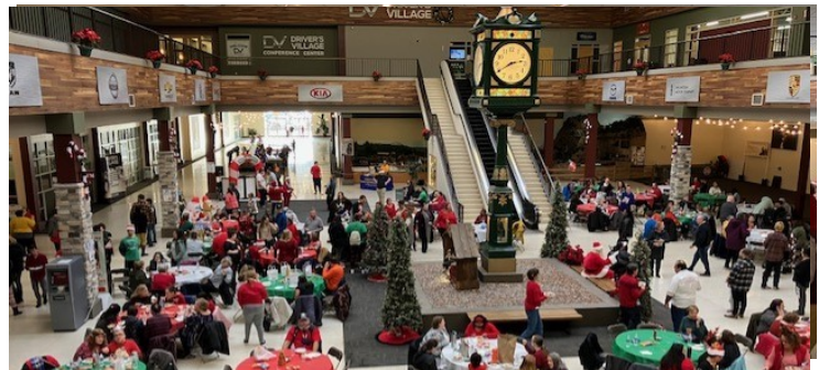
More photos from Advocates Annual Holiday Party inside!