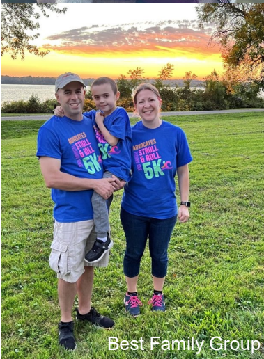
Best Family Group