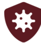
Advocates Community Habilitation Safety Measures