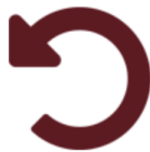
Reopening Safety Plan

When services are provided in Red, Orange or Yellow Cluster Areas/Hot Spot Zones: Advocates employees may only provide services 1:1 and may not support people to gather in groups of any size. See “Advocates Community Habilitation Safety Measures” below for complete guidance.